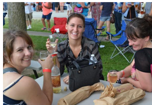
Pix at left: Some 2015 attendees enjoyed the wine tasting and the opportunity to buy some bottles of wine.

Last year the Sainte Marie Foundation; the Sainte Marie American Legion Post 932 family (this included the Legion, the Auxiliary and the Sons of the American Legion); the Jasper County Pork Producers; the Helpful Little Hands 4-H Club; St. Mary's Church; the N.C.H.S. football team and the Dundas Ruritan received funds.