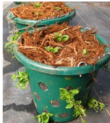
(At left: what the Flower Baskets look like when first planted in mid-March.)