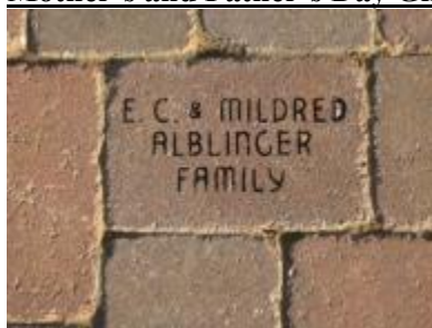
(At left) A sample engraved-stone

Stumped about what to get your parents (or other family members) when they have everything already?? Consider buying a brick on our Ken and Marge Hartrich Memorial patio (pix below) so that your loved ones will always have a "place" in our historical records at the Foundation House. Bricks may be purchased with two-line ($200) or four-line ($400) engraving of 12 characters per line. And you would be helping fund the Foundation with your donation. Send your request and check with printed copy to SMF, PO Box 186, Sainte Marie, IL 62459.