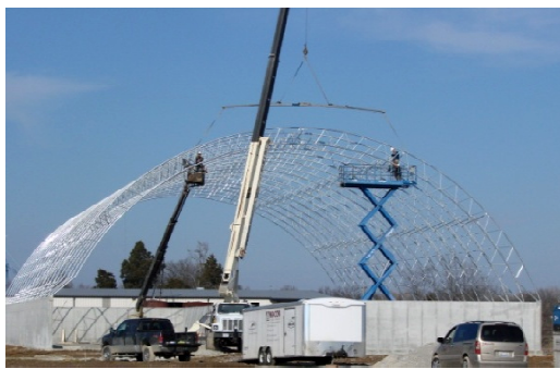
Workers on two lifts position the hoop structure on new grain elevator building.