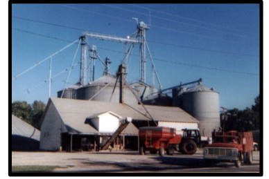
Mont Eagle Mills

Sainte Marie is a village that is still prospering, in an era when small rural towns are mostly disappearing. We think you will enjoy visiting a town that still maintains its quiet, unassuming identity in this fast changing world. Be ready to slow down and relax a bit!