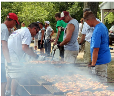
Cooking the Barbequed Chicken at the 175 th celebration 2012. (See below for 2013 event.)

Sainte Marie Foundation P.O. Box 186 Sainte Marie, IL 62459